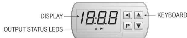
Fig. 2 – Frontal Panel

The N321 energizes the output relay such as to maintain the process temperature on the setpoint value defined by the user. The output status led P1 signals when the control output is on.